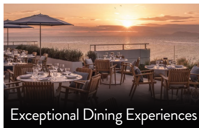
Exceptional Dining Experiences